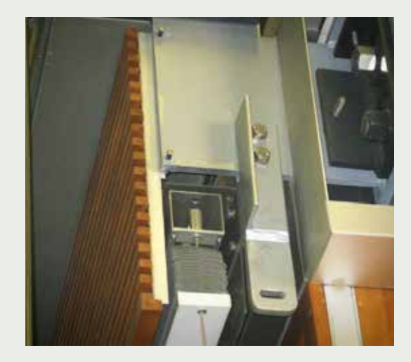
4: Upper spandrel unit

The spandrel units consist of the operating mechanism for controlling the aluminium slatted blinds and the fixings for attaching the façade to the building.