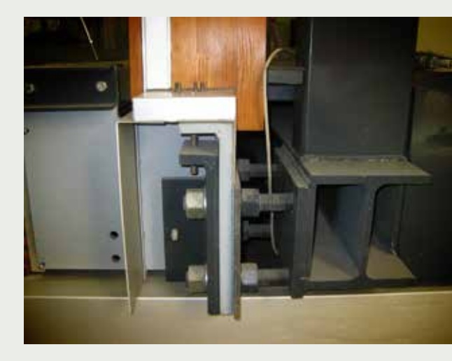
Fig 5: Lower spandrel unit